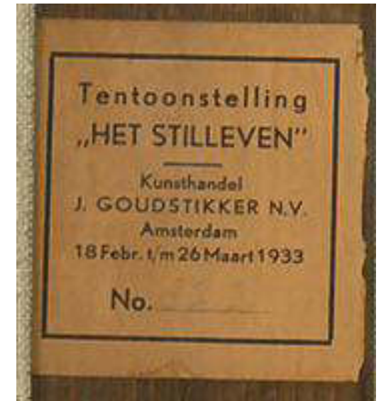
- Label from the exhibition „Het Stilleven“, 1933