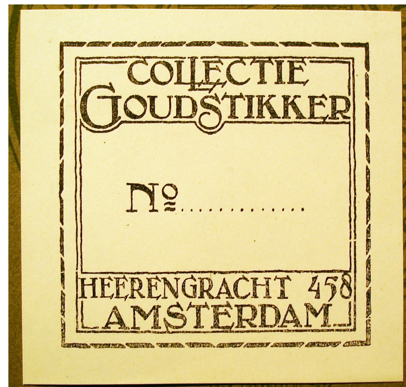
- Third Gallery Label, Heerengracht 458 square version, ca. 7 x 7 cm