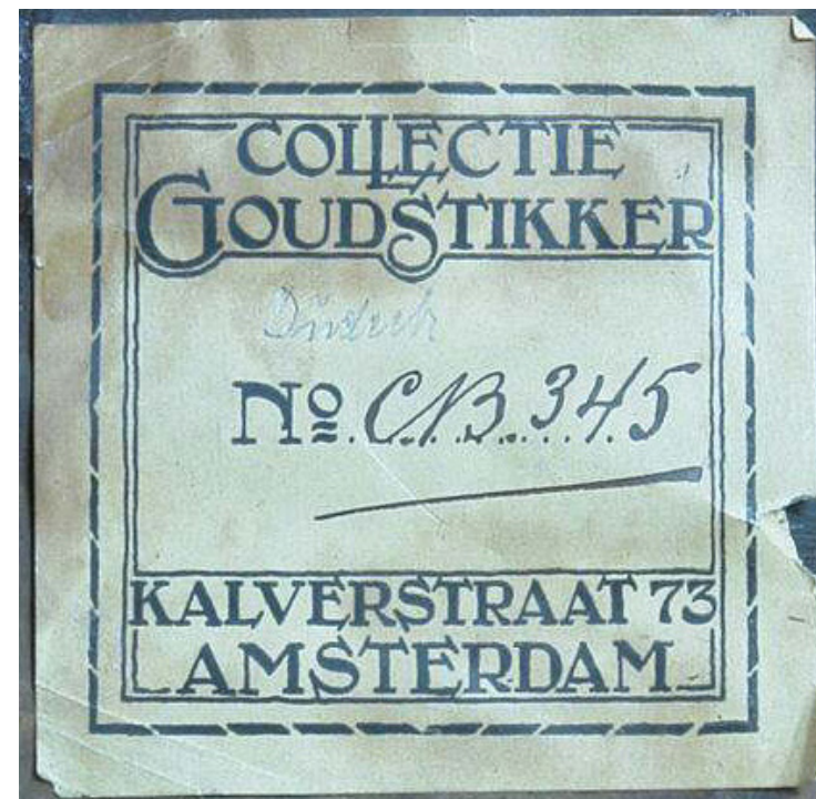
- Second Gallery Label, Kalverstraat 73, square version, ca. 6.5 x 6.5 cm