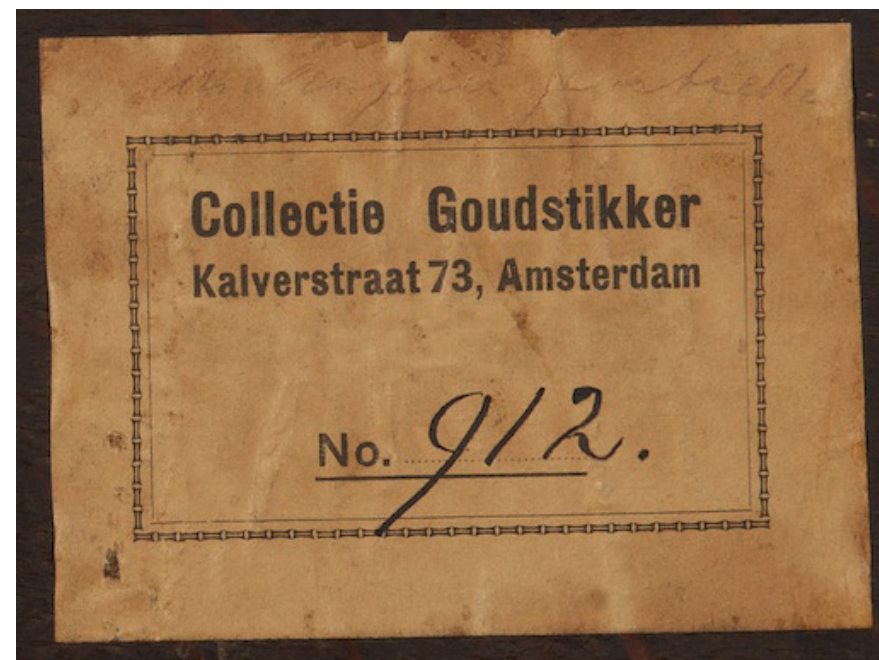
- First Gallery Label, Kalverstraat 73, ca. 5.7 x 8 cm

Along with the negatives, an ample proportion of the Goudstikker inventory card file was also acquired by the RKD in 1951. Like the “Black Notebook” and the inventory book, they also do not contain illustrations. But unlike the “Black Notebook,” the individual index cards, in the event a photograph was taken, specify the name of the photographer and the photograph number and in which exhibitions catalogs or catalogs of the Goudstikker dealership the artworks were illustrated or described. Because Miedl continued the card file during the occupation period there are in many cases dispatch memoranda with the names of interested parties who were offered the paintings for sale as well as well as dispatch memoranda with the names of the actual buyers. The original Goudstikker card file is however by no means still complete. The largest portion of the index cards still preserved today mainly comprises artworks from the Miedl period between July 1940 and 1945. They once again document his criminal actions as the cards name those persons from whom Miedl “acquired” the pictures, for example from the Jewish art dealer Nathan Katz. It is still unclear according to which criteria the index cards were removed, at what point in time and by whom. 8