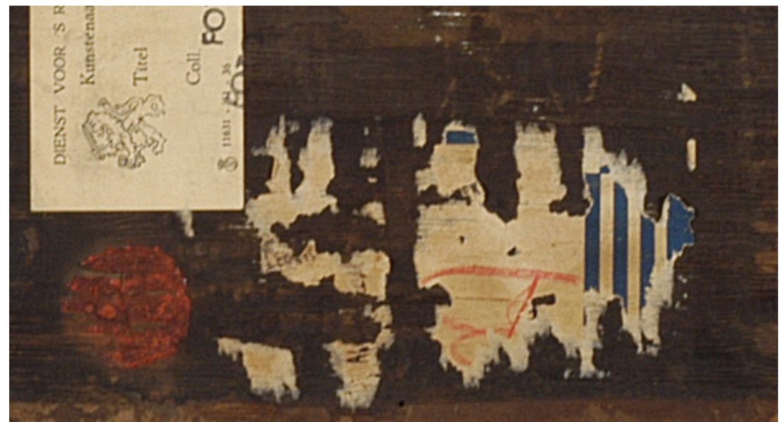
- partly erased Standard Label with typeset stamp „ACCOUNTANTSKANTOOR POLAK, WOLFRAT, ENTROP EN VAN NAMEN“ and seal