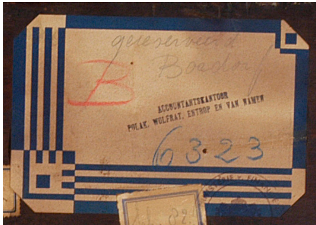
- Standard Label with typeset stamp „ACCOUNTANTSKANTOOR POLAK, WOLFRAT, ENTROP EN VAN NAMEN“