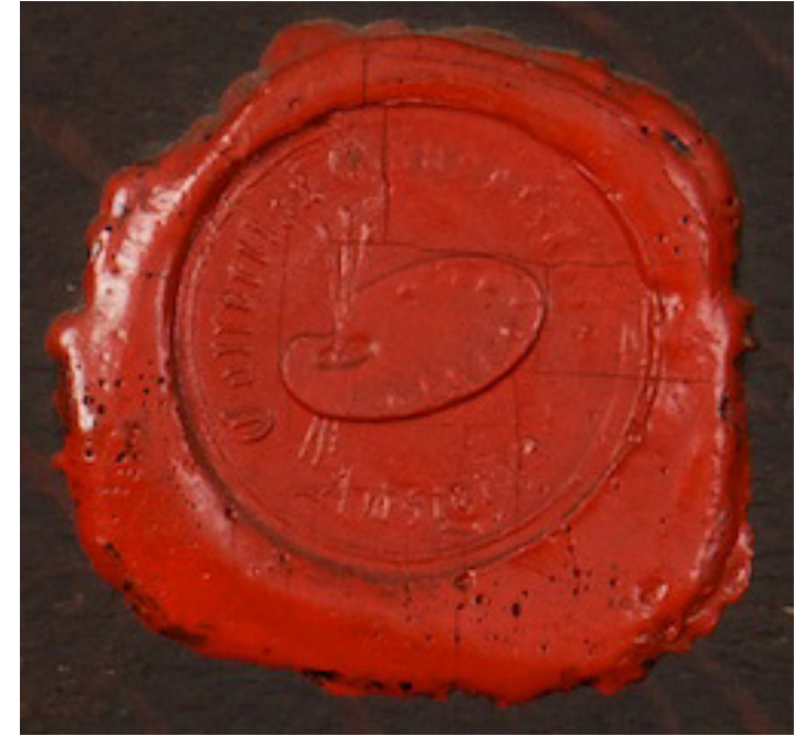
- Wax Seal with painting palette and brushes and inscription „Collectie Goudstikker - Amsterdam“