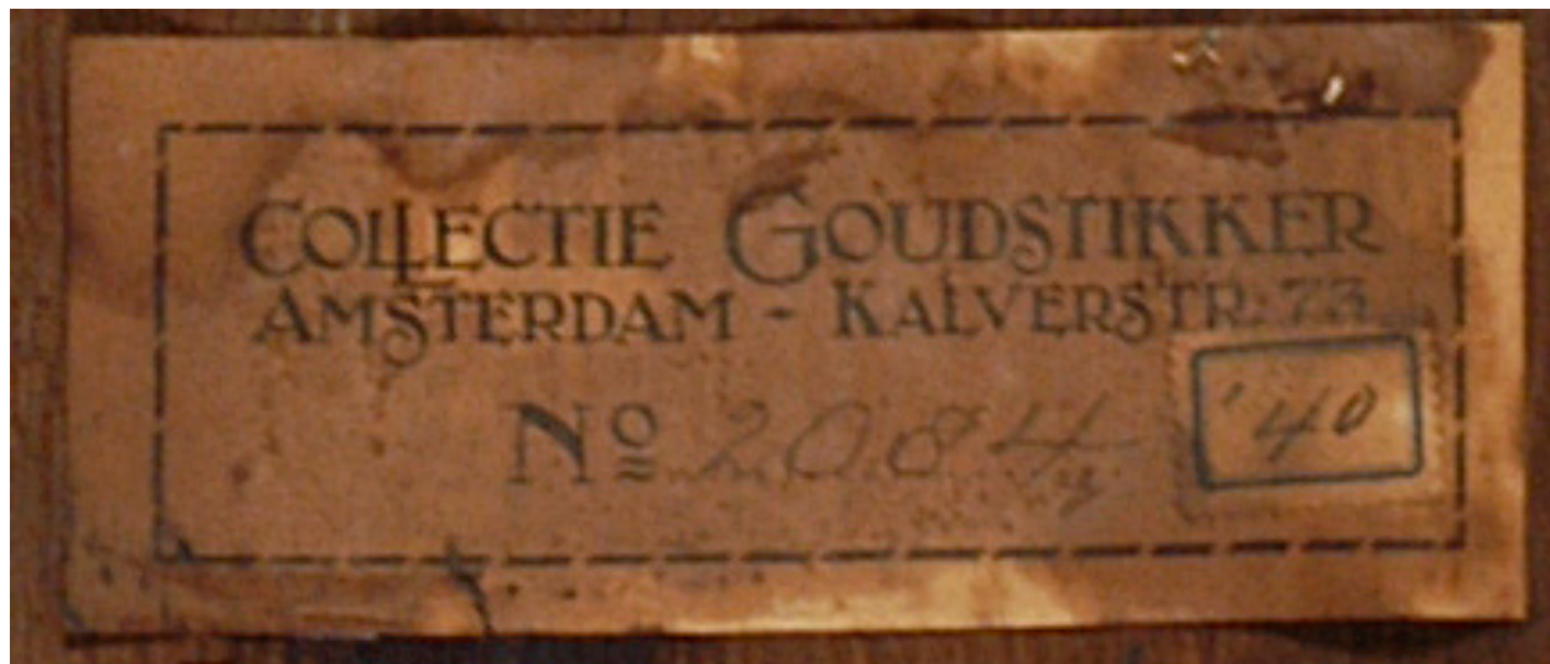
- Second Gallery Label, Kalverstraat 73, rectangular version, ca. 5 x 12 cm with revision sticker „40“

»COLLECTIE GOUDSTIKKER KALVERSTRAAT 73 - AMSTERDAM No. ....«