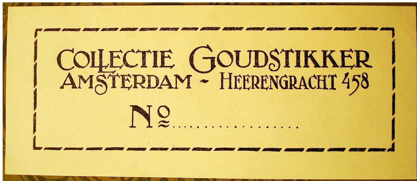
- Third Gallery Label, Heerengracht 458 rectangular version, ca. 5 x 11,5 cm

»ACCOUNTANTSKANTOOR POLAK, WOLFRAT, ENTROP EN VAN NAMEN«