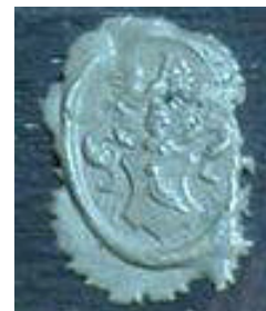
- other wax seals used by the Jacques Goudstikker Gallery